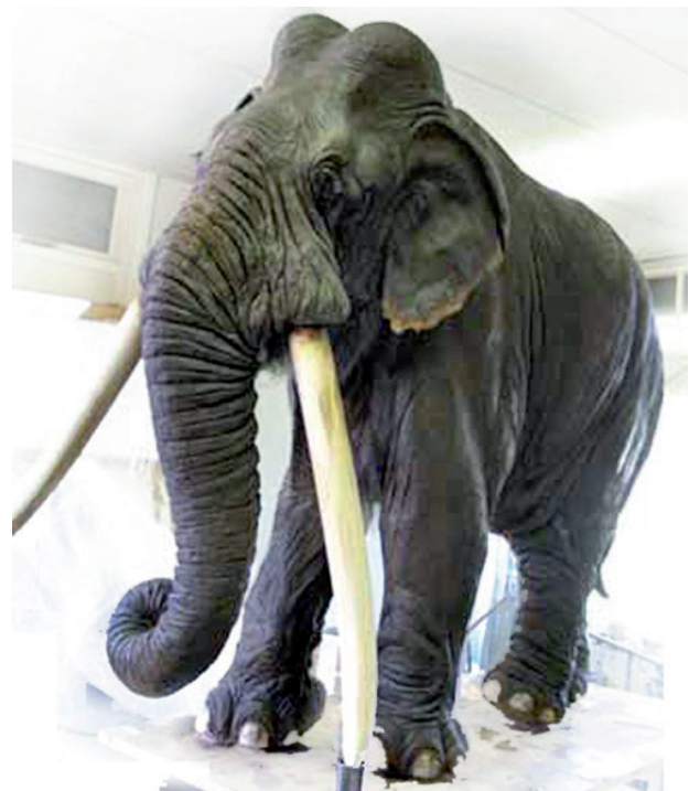
E. antiquus reconstruction (model by Manimal Works – Rotterdam, http://www.manimalworks.com )

having been excerpted by Leroi-Gourhan for this subject only 20 pictures out of 739 in his greatest scientific work (LEROI-GOURHAN 1971), related to eleven sites (France, Spain and Germany), here listed in alphabetical order: Arcy-sur-Cure – F, Bernifal – F, El Castillo – E, El Pindal – E, Font-de-Gaume – F, Gönnersdorf – D, Grotte Chabot – F, La Baume-Latrone – F, La D rouine – F, Pech-Merle – F, Rouffignac – F. We may add the scratched figure over an ivory plate at La Madeleine rock shelter – F, the very accurate 14 figures from Les Combarelles Cave – F, the red and brown painted ones at the Cougnac Cave – F, the low relief at the Grotte de Saint-Front – F and some more recent discoveries, like the red-painted figures and the scratched ones at the Chauvet Cave – F, the scratched woolly mammoth at the Cussac Cave –