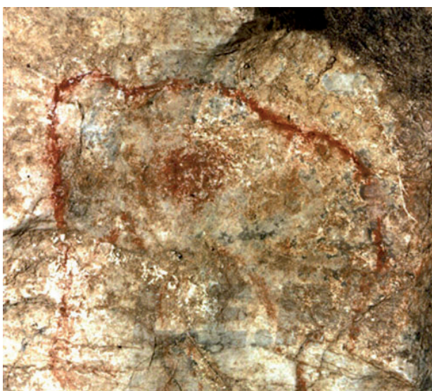
Elephant or naked mammoth figure from El Pindal cave – E