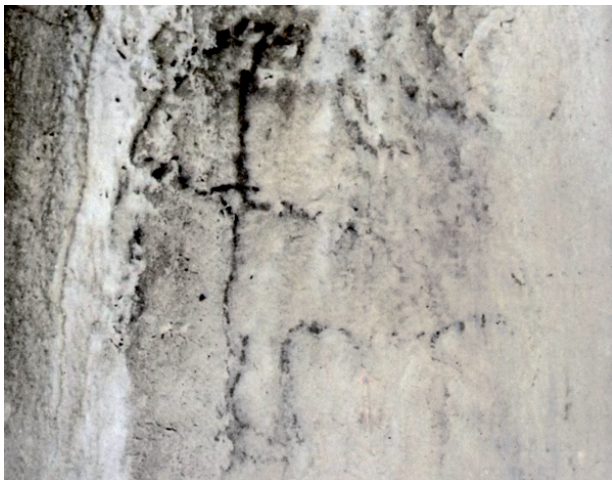
Elephant or naked mammoth figure from Toulourenc cave – F (by P. Bellin)