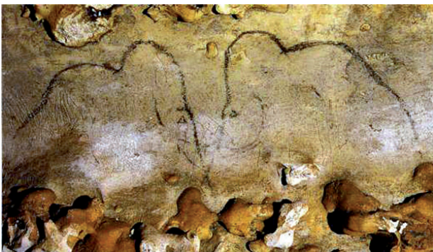
Mammoth depictions at Rouffignac cave – F