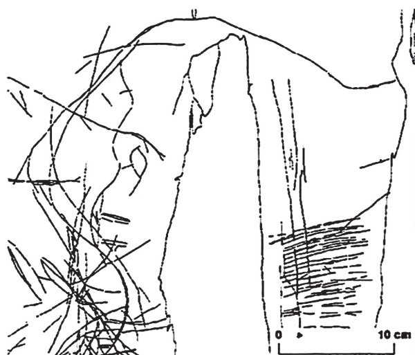
The scratched elephant head over the Vermelhosa 1 rock (tracing Gravado no Tempo )