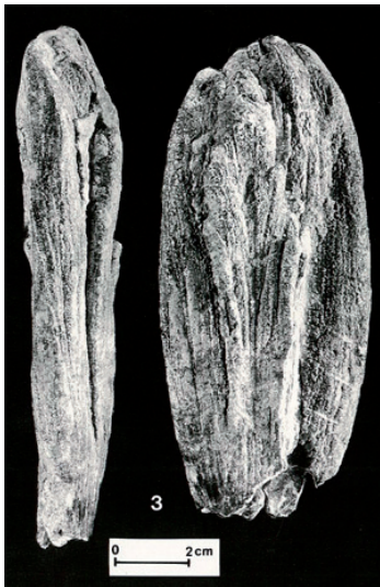
E. antiquus undeterminate molar, Foz do Enxarrique – P (by Antunes Cardoso 1992)

F, the scratched ones at the Deux-Ouvertures Grotte – F, the ivory statuette from the Vogelherd Cave – D and the possible carved mammoth figure at Cheddar Caves – UK. Obviously, the presence of mammoths is also testified by the ivory remains, like the spectacular mammoth-bone huts in Ukraine.