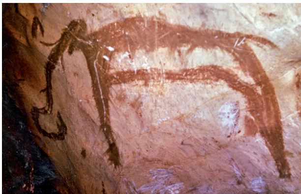
Elephant or mammoth figure from Baume-Latrone cave – F

survival phase of the Elephas antiquus in the western Iberian peninsula;