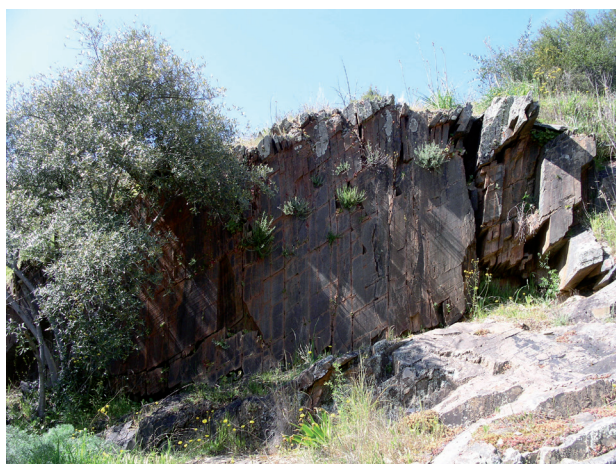
The vertical panel of the Vermelhosa rock 1

A window over Vermelhosa rock art (left bank of the Douro river, near the Côa river confluence – P) was published many years ago in one of the first issues of TRACCE Online Rock Art Bulletin (ABREU SIMÕES DE et al. 1996; ARCÀ 1996; BRAVO NUNEZ 1996; CAMPOS 1996; FOSSATI 1996) and in the 3 rd volume of the proceedings of the XIII UISPP Congress (SIMÕES DE ABREU et al. 1998); this last is re-published (full text-image flip book and PDF) in the same issue of this TRACCE short paper. We may remind that the Côa river area houses the main and largest European open-air Palaeolithic rock art complex.