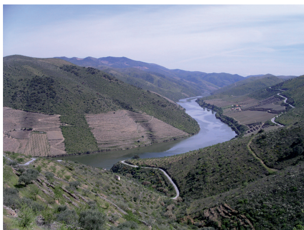
Douro river valley, Portugal, the Vermelhosa area

Footsteps of Man archeological Society (Valcamonica – I)