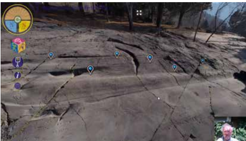
How-to video 3: opening NAQ1 areas and sectors ( http://www.euopreart.net/NAQ1/video/NAQ1_03_discover.mp4?_=3 )