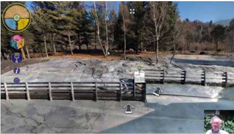
How-to video 2: panning and zooming ( http://www.euopreart.net/NAQ1/video/NAQ1_02_navigate.mp4?_=2 )