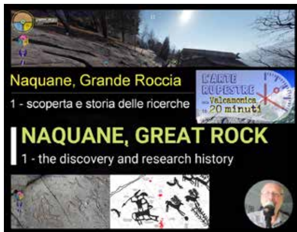
Great Rock , research history, video presentation ( Valcamonica Rock Art in 20 minutes series) https://youtu.be/GumlldAOI9E