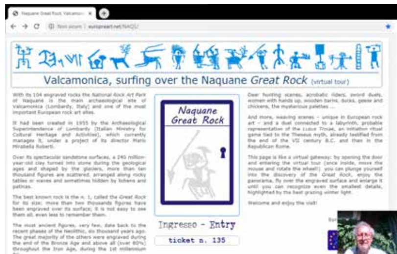
How-to video 1: entering the NAQ1 Virtual Tour ( http://www.rupestre.net/tracce/wp-content/uploads/2020/05/NAQ1_01_enter.mp4?_f=1 )

Even if the Park is open to visitors, there is a shortcut: you may enjoy an online free visit. Just find the door, open it with a click, click again inside and enter the virtual tour of the