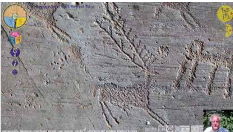
How-to video 4: detailed pictures and tracings ( http://www.euopreart.net/NAQ1/video/NAQ1_04_sectors.mp4?_=4 )

The whole surface has recently been traced and studied by the rupestrian archaeologist who is writing this paper, under a research program of Milan and Pisa Universities and the authorization of the Archaeological Superintendence.