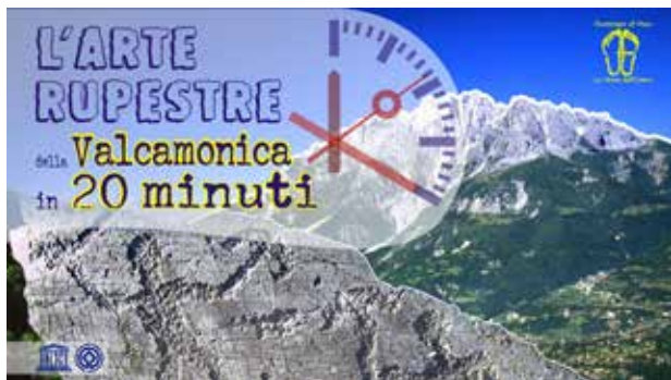
Valcamonica Rock Art in 20 minutes ( http://www.rupestre.net/valcamonica20min )