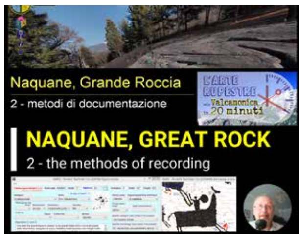
Great Rock , the methods of recording, video presentation ( Valcamonica Rock Art in 20 minutes series) https://youtu.be/YI6WBsynBhI